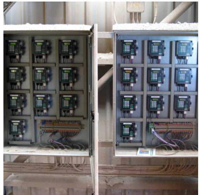
20 Blackbox Units housed in control cabinet.

The system of choice for this site was the Blackbox controller accompanied with the dB15 Transducer Series, the Blackbox is compact and easy to install, a useful timesaver for the site was the ability to clone several of the units using the same programming parameters. As the silos were all a similar size, they could all be pre-programmed before installation, which reduced process downtime. The 20 Blackbox units, two for each silo, were mounted in a control cabinet, and each connected to a Pulsar dB15 Transducers mounted on an aiming kit so that it could be directed towards the silo draw-off point. The units were then multiplexed through a Profibus connection to the site SCADA system.